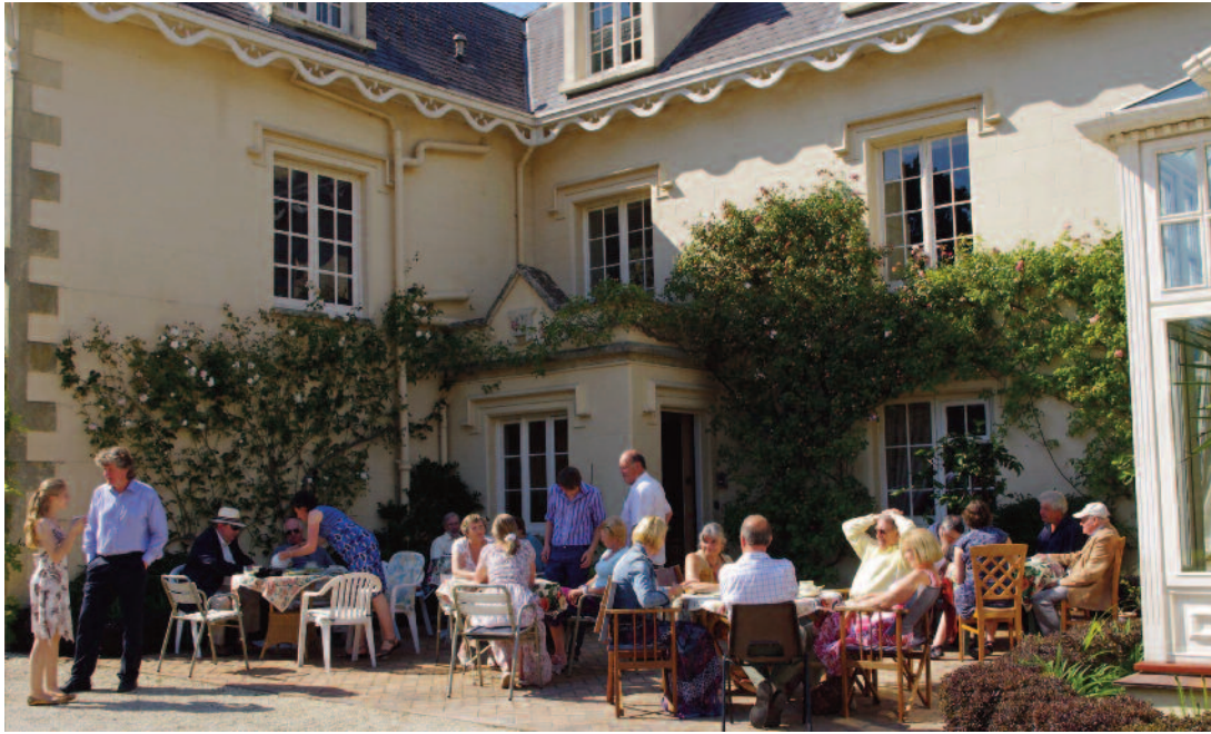
Tea party at the Manor following the performances by the competitors for the 2011 Nancy Carr Prize