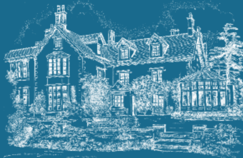
The Manor, Cossington

This, our third festival weekend, embodies all that is best about Cossington Concerts - superb music sublimely performed in charming surroundings, and supported by stimulating talks and agreeable social occasions.